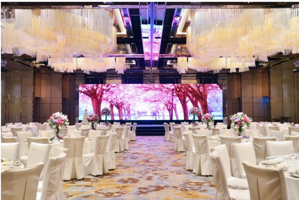
The Diamond Ballroom, Level 3